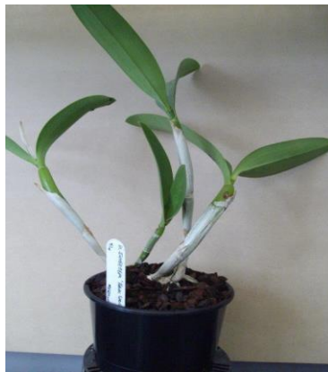
8. Over growth final potted