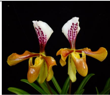
Dieter Weise's Paphiopedilum gratix