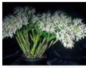
Dendrobium falcorostrum 'Melissa' HCC/OSCOV CC/OSCOV