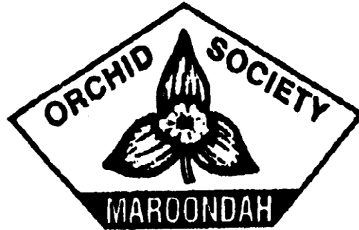
Lycaste Club Emblem

Lycastes are orchids of the New World Tropics and Subtropics