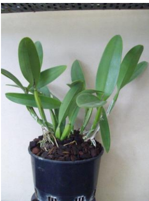
10. Original plant potted on.