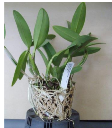
9. Original plant with overgrowth removed