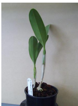
12. Over-growth showing new growth eye and position of plant to allow new growths.