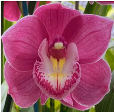
Leo Orland's Cym. Lunar Blaze 'Dural' x Valley Olympic 'Rose'