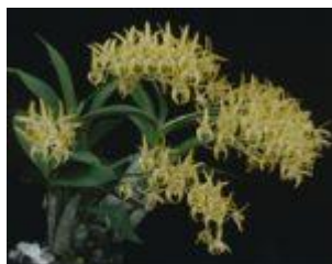
Dendrobium Avril's Gold 'Rolled Gold' HCC/OSCOV