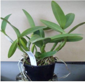
5. Original plant with growths removed.