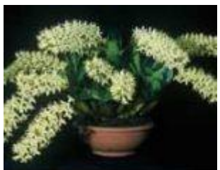
Dendrobium speciosum 'Barry' HCC/OSCOV CC/OSCOV

These cultural notes are kindly provided by the North-East Melbourne Orchid Society.