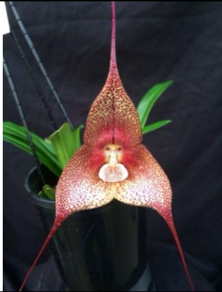
Kong and Fun's Dracula Quasimodo 'Judy'