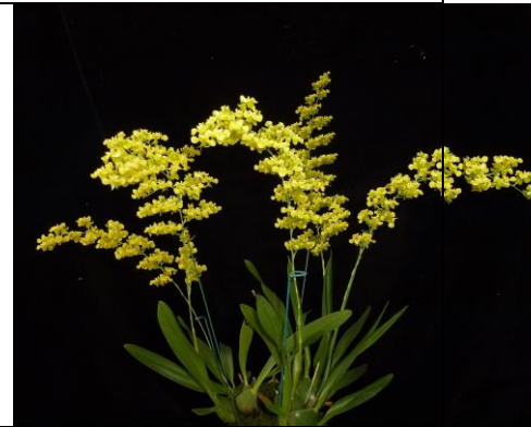
Dieter Weise's Oncidium cheiroporum