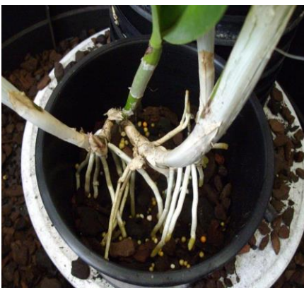
7. Over growth half potted showing fertiliser placement on mix