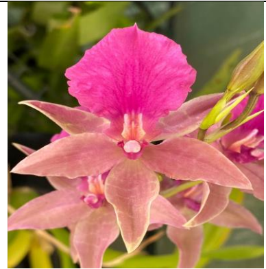
Leo Orland's Odontonia Pacific Paranoia 'Other Side of Kool'